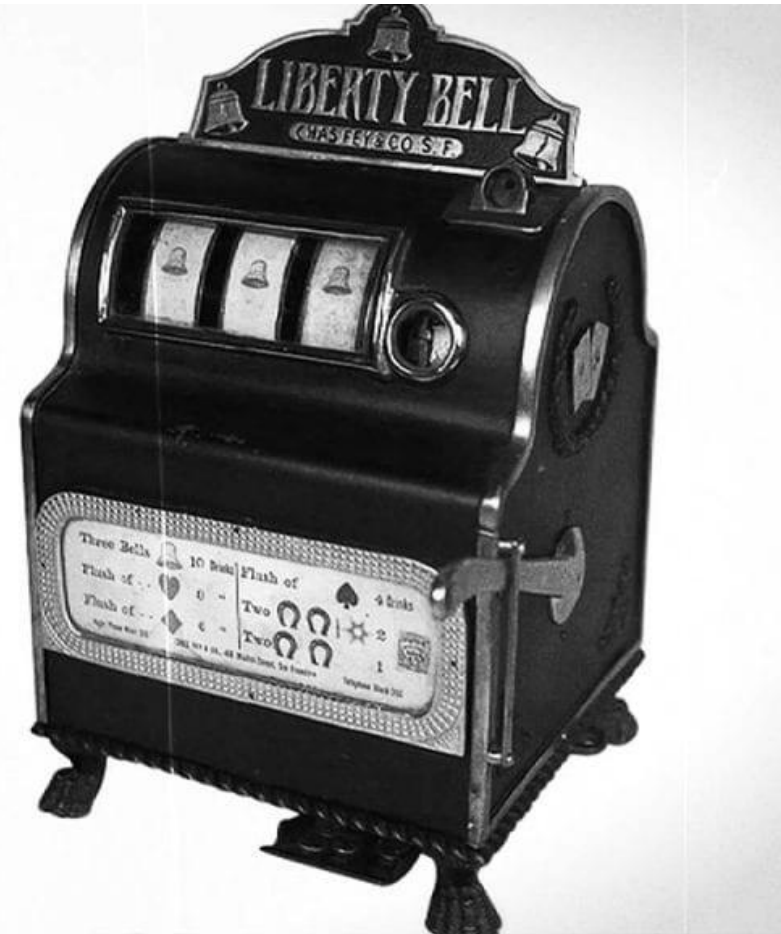
“The Thomas Edison of Slot Machines”