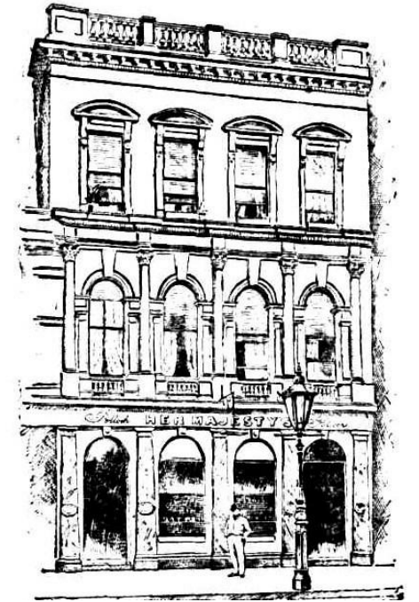
Her Majesty's Hotel, Swanson St, Melbourne.

The hotel was one of the first to introduce poker machines into the Australian colonies.