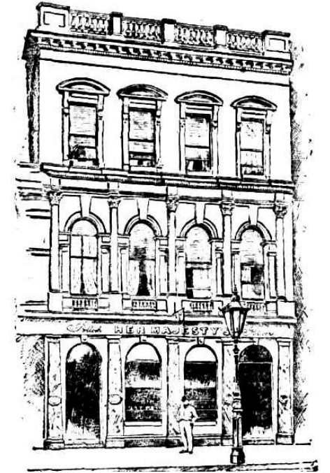
Her Majesty's Hotel, Swanson St, Melbourne.

The hotel was one of the first to introduce poker machines into the Australian colonies.