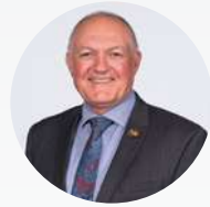
DAVID HARRIS MP