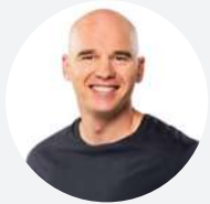
MC - RABS