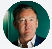
LUKE MANGAN OAM