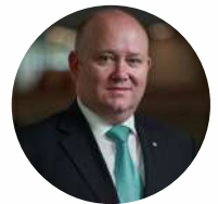
SHANE FITZSIMMONS AO AFSM